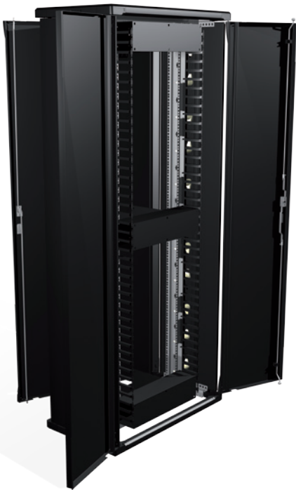
Brand-Rex Datacentre Cabinets and Racks High Density Copper Cabling Cabinet